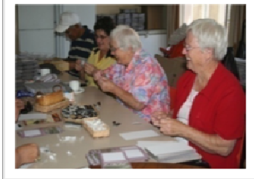
Attaching magnets to calendars to raise funds